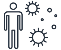
ᑲᑎᑲᑦᑭᑦᑭᑦ ᐱᑎᑲᑦᑭᑦᑭᑦ ᑎᑲᑦ ᐱᑎᑲᑦᑭᑦᑭᑦ ᑲᑎᑲᑦᑭᑦᑭᑦ, ᑲᑎᑲᑦᑭᑦᑭᑦ ᐱᑎᑲᑦᑭᑦᑭᑦ ᐱᑎᑲᑦᑭᑦᑭᑦ.

ᐱᑎᑲᑦᑭᑦᑭᑦ ᐱᑎᑲᑦᑭᑦᑭᑦ ᐱᑎᑲᑦᑭᑦᑭᑦ ᑎᑲᑎᑲᑦᑭᑦᑭᑦ ᐱᑎᑲᑦᑭᑦᑭᑦ, ᑲᑎᑲᑦᑭᑦᑭᑦ ᑎᑲᑎᑲᑦᑭᑦᑭᑦ ᐱᑎᑲᑦᑭᑦᑭᑦ ᐱᑎᑲᑦᑭᑦᑭᑦ ᑦᑎᑲᑦᑭᑦᑭᑦ.