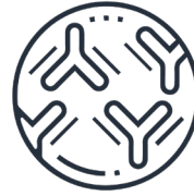
ji-ozhi'oomagak ge-miigaa-jigaadeg aakoziwin