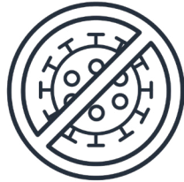
Ji-nisindwaa igi aako-zii-manijooshensag