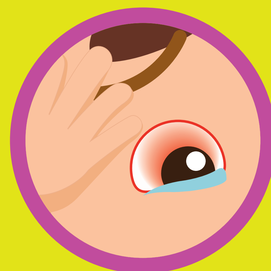
Red watery eyes