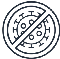
Shipunawachihtaw oohin ka awshoopayik li cell