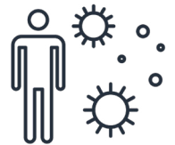
Kishkishi ooma ahkoush- iwin akaw tawnsheeshi kawnootinamin, kishpin ki nakishkamin keestwawm

Peekishkway avek li publik la saantii pamihwayw didawn toon a lawntour, kishpin aen kesyoon ki ayawn ouschi ooma cheestahouwin.