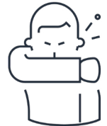
Aagawi'idizon ososodaman gaye jigiziinigeyin

Ganoosh mino-ayaawin gaa-naagajitood gidazhiikewining giishpin gegoon wii-gagwedweyin iwe ashowizii-mashkiki onji.