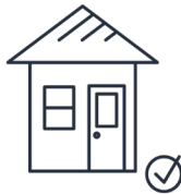
Abin endayin aakoziimanji'oyin